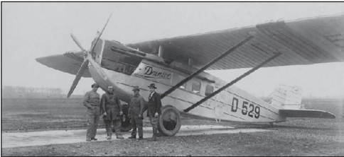
THE PABODIE-LAKE ANTARCTIC EXPEDITION OF 1930