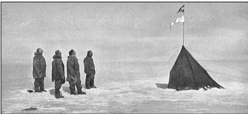
AMUNDSEN'S SOUTH POLE EXPEDITION OF 1910