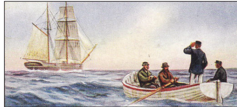
THE MYSTERY OF THE "MARY CELESTE"