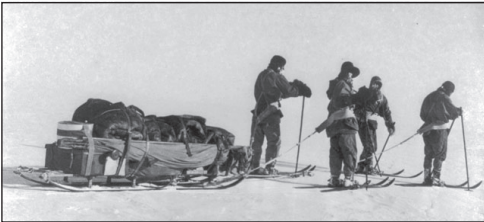
THE TERRA NOVA ANTARCTIC EXPEDITION OF 1910