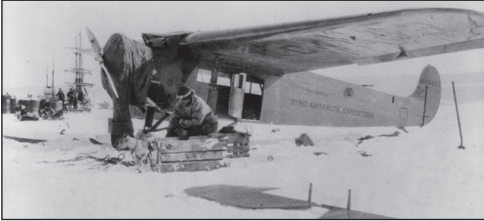
THE BYRD ANTARCTIC EXPEDITION OF 1928